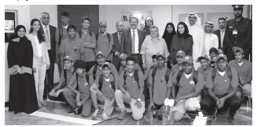
The National Institution hosted students of the Royal Academy of Police (RAP) during its summer camp.