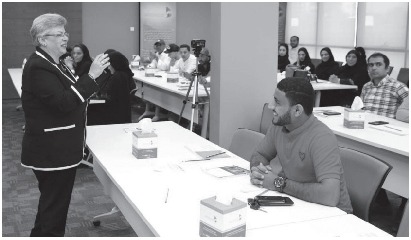
Training for the 5th batch of students of the Human Rights Diploma and students of Social Service Diploma in Security Institutions, Royal Academy of Police.