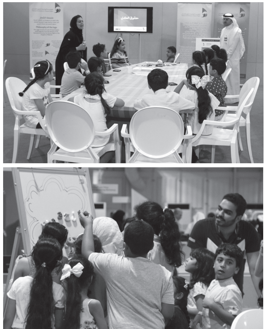
Child rights awareness lectures in Bahrain Summer Festival, July 2018.

The NIHR participated in the 10<sup>th</sup> edition of the annual Bahrain Summer Festival (July 2018), one of the most anticipated events in the Kingdom of Bahrain due to its multi-cultural programs. The festival runs for two consecutive months and offers a variety of activities and workshops, especially for