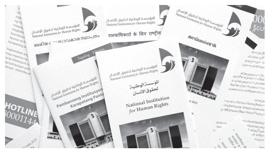
NIHR leaflet about its role and the procedures for receiving complaints in six different languages.

NIHR also published a leaflet about its role and the procedures for receiving complaints in six different languages: Arabic, English, Filipino, Hindi, Malayalam and Thai. NIHR also distributed bookmarks to spread awareness on its role in protecting and promoting human rights in the society.