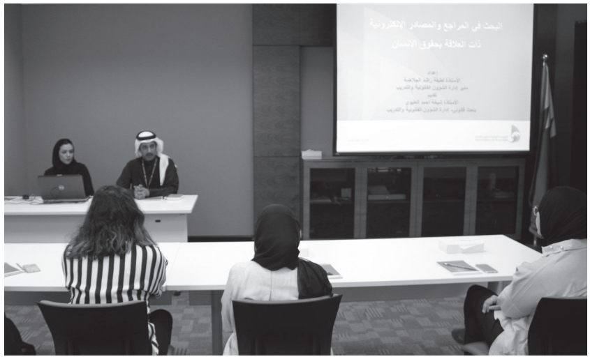
Visit of RUW student to the NIHR headquarters.

tivities and training courses for all segments of society, especially university students, on subjects related to human rights.