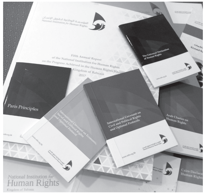
NIHR print publications.

As to the publication of printed materials, the NIHR printed a number of international and regional documents in Arabic and English languages related to human rights, such as the Paris Principles related to the National Institutions for the Promotion and Protection of Human Rights, Universal