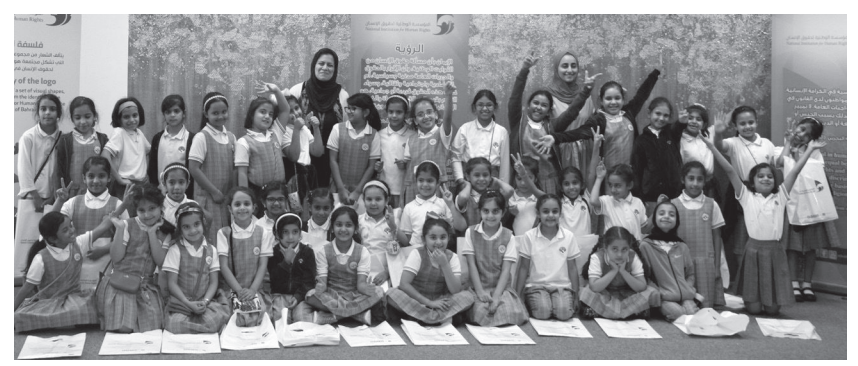
NIHR event on "The Rights of the Girl Child," 11 October 2018.

The event highlighted the suffering of young and old people with autism, and mostly focused on the needs of this group, the main challenges they faced and how to integrate them into society since the main problem of this group lies in the community's awareness of their situation.