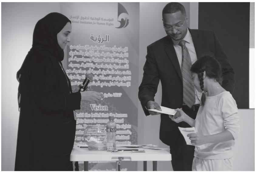
NIHR participation at "Youth City, 2030", 30-31 July 2018.

Studies Institute (JLSI) and the Supreme Council for Women (scw), and it continued till the end of 2018. The program targeted employees of government institutions and members of civil society organizations. It had five packages, namely, the national institutions in the Kingdom of Bahrain, the culture of citizenship, the human rights skills, culture, the rights and free-