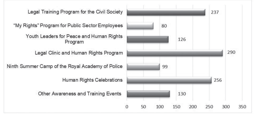
Chart 1. Training events, programs and beneficiaries - 2017