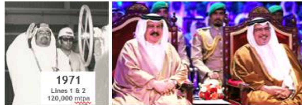
Ownership Structure (2022)