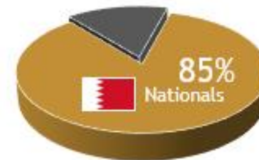
Alba's Workforce (2022)

1 st Bahraini manufacturing company listed on both Bahrain Bourse and London Stock Exchanges (2010)